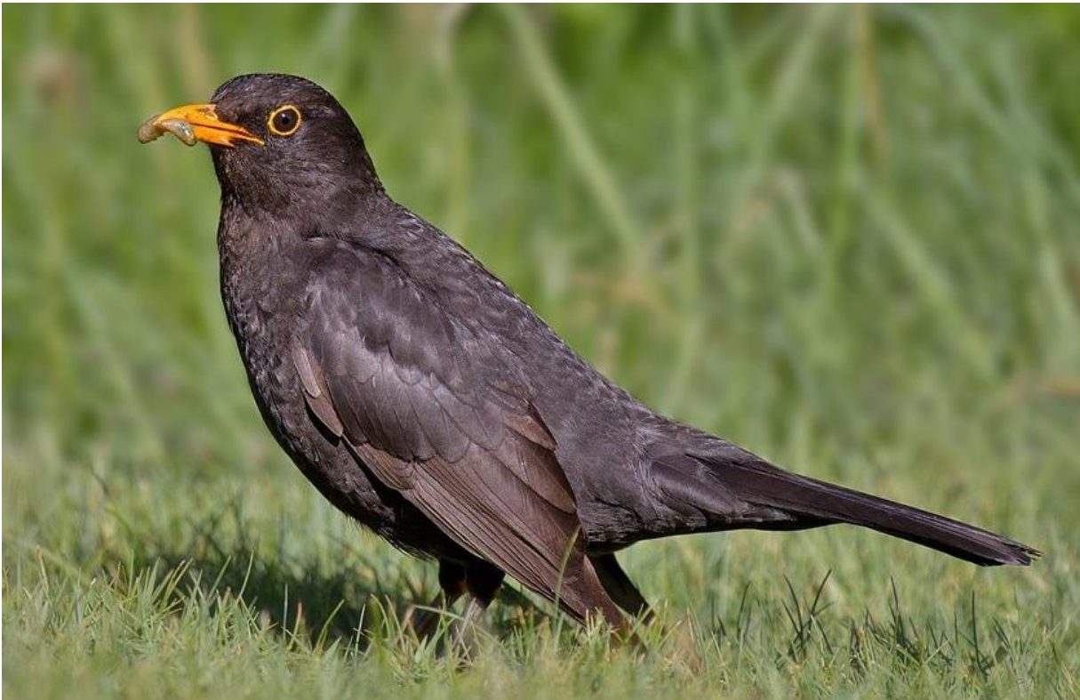
Common blackbird

Birds such as gulls and blackbirds have developed such a diverse diet that they can inhabit a wide range of environments. The blackbird is a recent immigrant with a variety of adaptations that suit it to a wide range of environments. It can be found in places as diverse as towns, cities, orchards, farms and remote forests, from the sea to mountaintops.