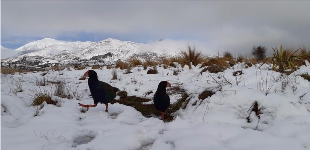
Takahē in Fiordland

The fantail – with its varied diet of flying insects, its treetop nests, and its acrobatic flying skills – has adapted to survive in the presence of people.