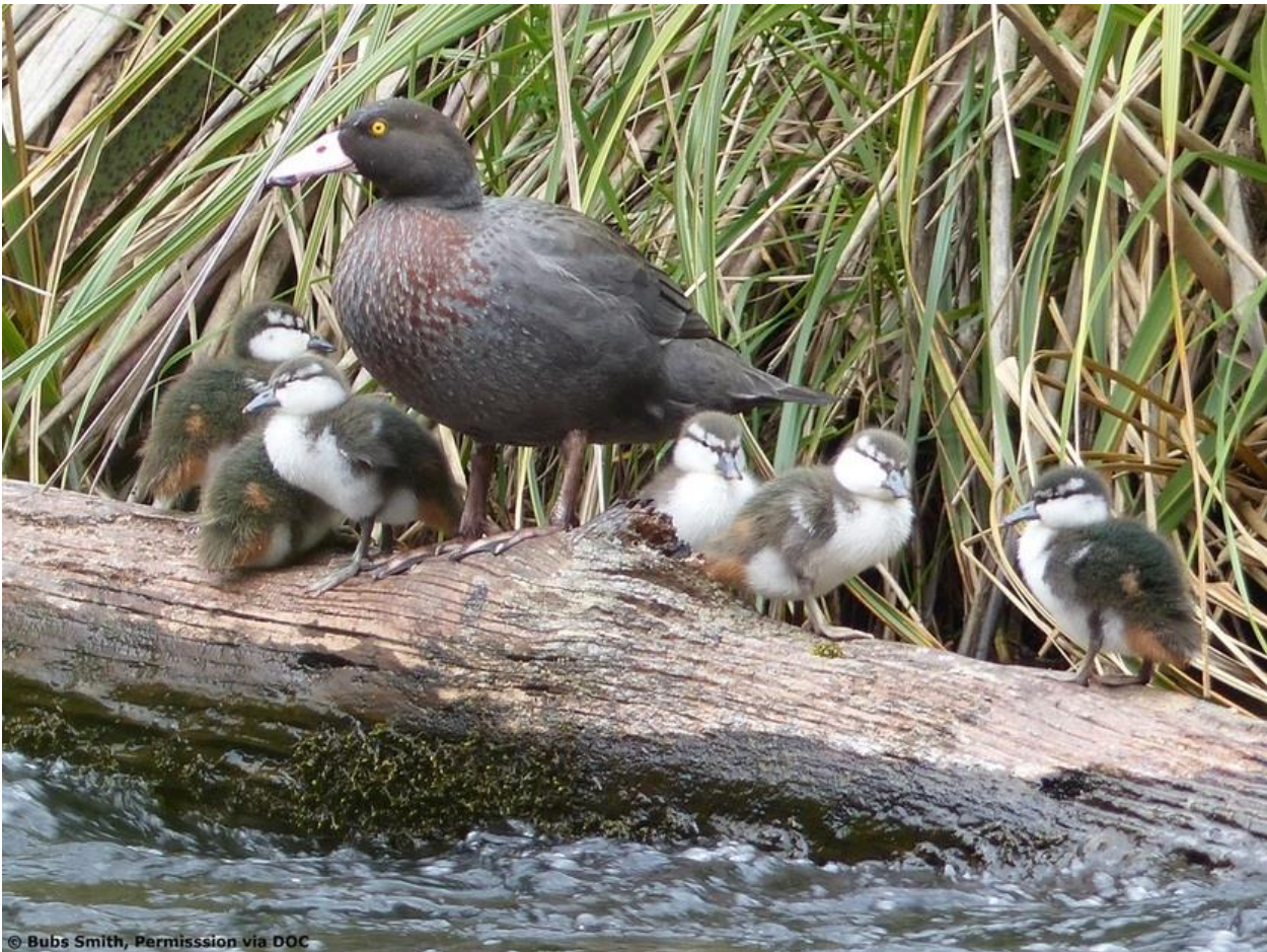
Whio with ducklings

These are the basic structures that define these animals as birds.