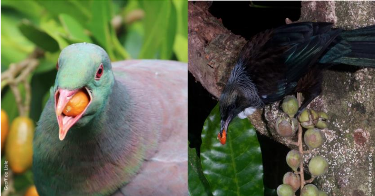
Kererū, © Geoff de Lisle. Tūī, courtesy of Ngā Manu Images

Different bird species can occupy the same habitat without competing for food because of their different feeding structures