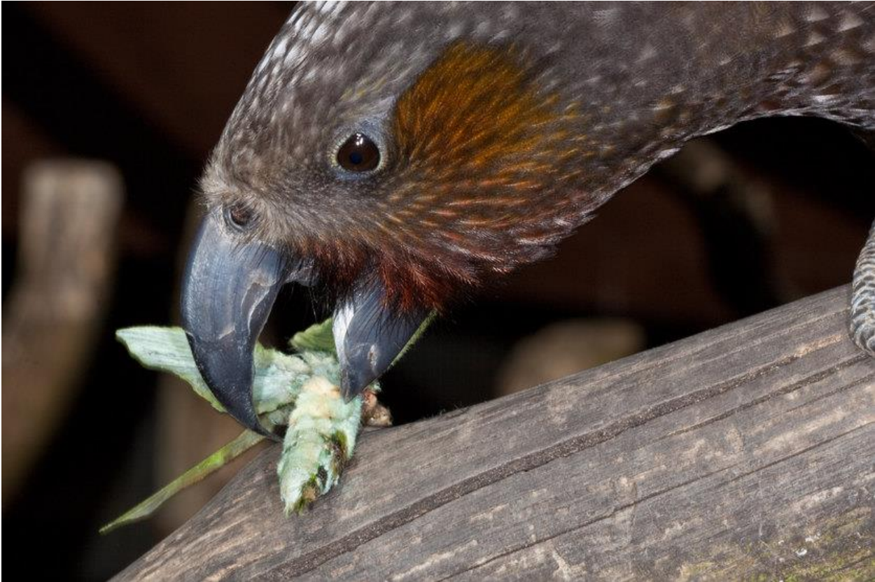
Kākā eating a pūriri moth

We can usually tell what sort of food a bird eats by looking at its beak and feet