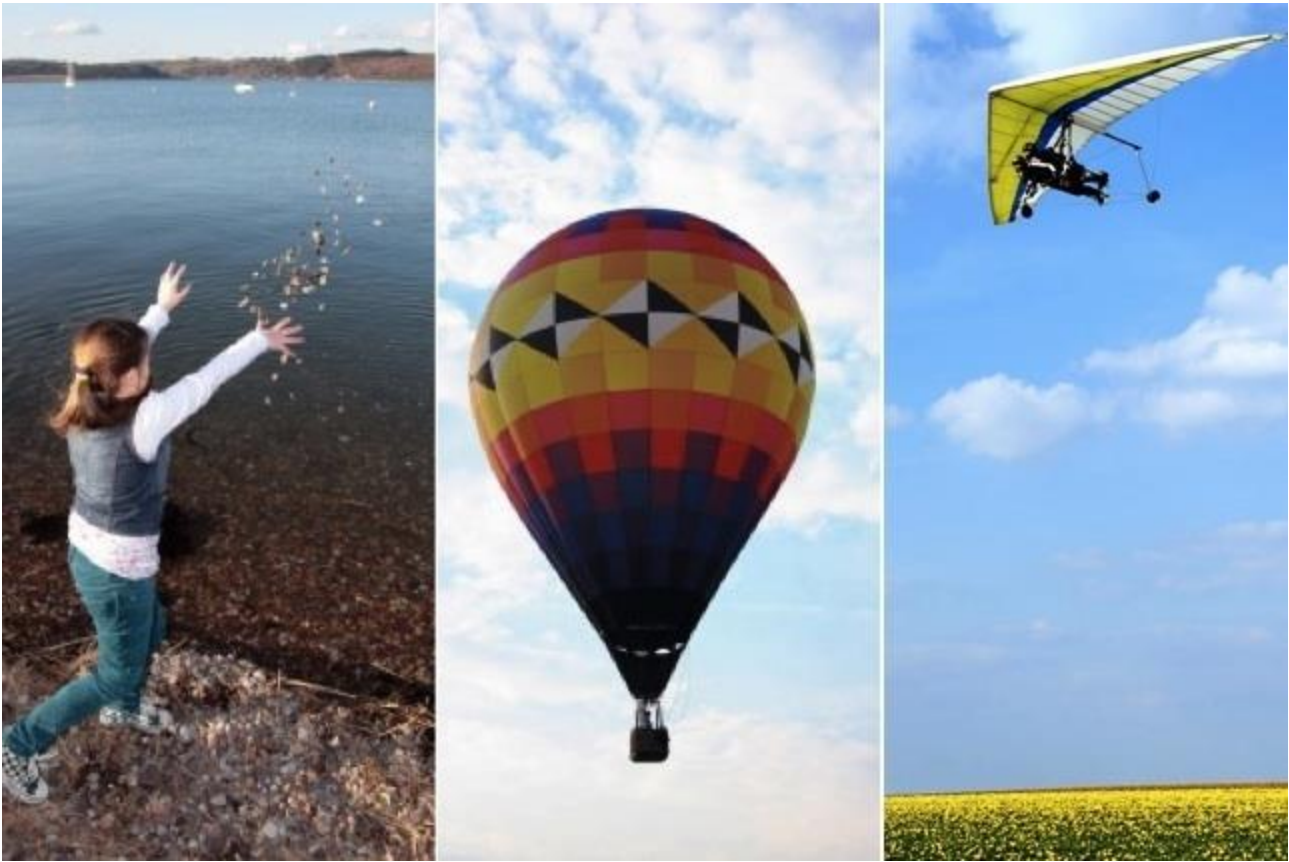
Child with stones, morrbyte; hot air balloon, mattkaz; both licensed from 123RF Ltd

For something to float in air, it needs to be lighter than the same volume of surrounding air. Its particles are either lighter or less tightly packed than the particles of the air it is in.